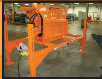
Customized stands with stationary power supply available.