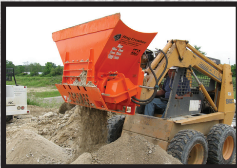
Step 3: Powerful Hog Crusher pulverizes debris in minutes.