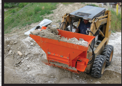
Step 2: Level Hog Crusher and start recycle process.