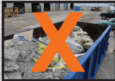
Step 4: Stop paying to have recyclable debris removed from job site.