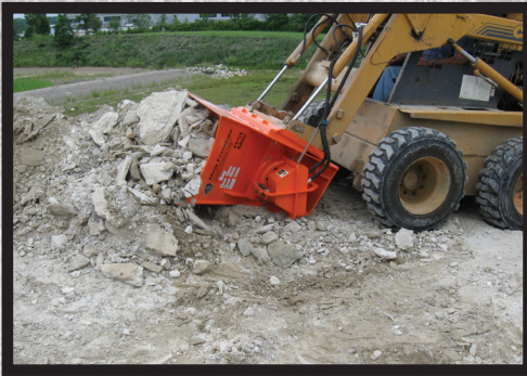
Step 1: Scoop up recyclable material.